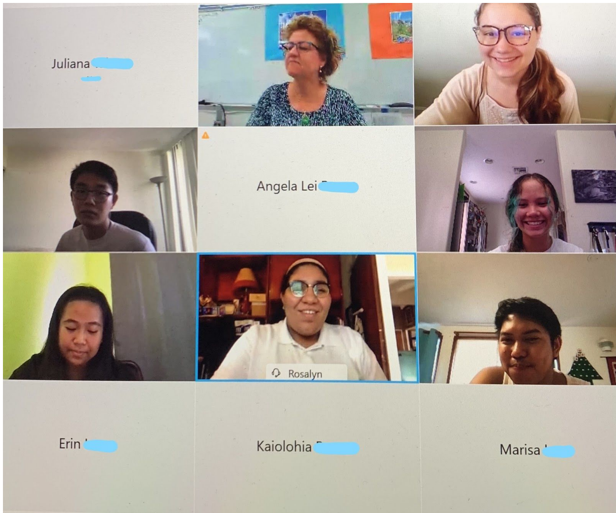
Spanish Learn a Language Program Session